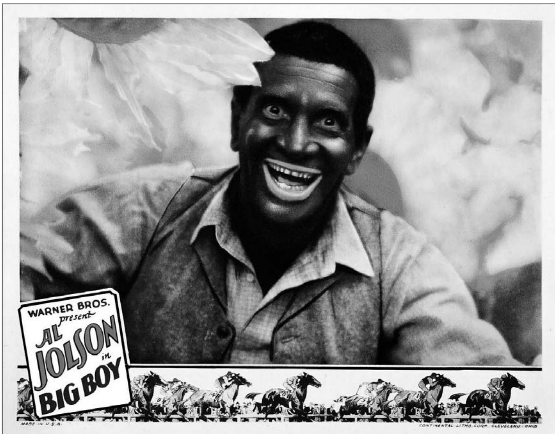
Fig. 15. Lobby card advertising Al Jolson in the 1930 film version of Big Boy .

Jolson’s mobilization of blackface needs to be investigated with greater accuracy, nuance and depth, and in this respect it is important to recognize that Jolson did not play an African American in The Jazz Singer (he played Jackie Rabinowitz aka Jack Robin, a blackface jazz singer). However, he did play a black character – Gus – in many of his stage musicals including Big Boy , in which Gus was a jockey devoted to the colt Big Boy, which grows up to race in the Kentucky Derby. In performing Gus, Jolson did not try to render invisible the mask of race and theater. It was a self-conscious construction with similarities to Chaplin’s gentleman tramp, who took on different circumstances and occupations from film to film but always remained “Charlie”.