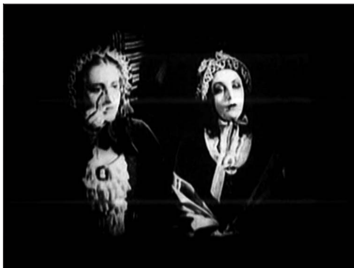
Figs. 6 and 7.