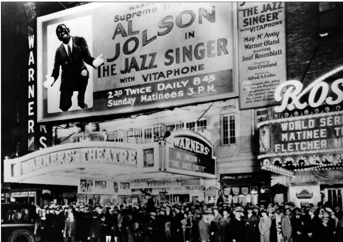
Fig. 1. The premiere of The Jazz Singer at the Warners' Theatre, Broadway and 52nd Street, New York City, 6 October 1927.