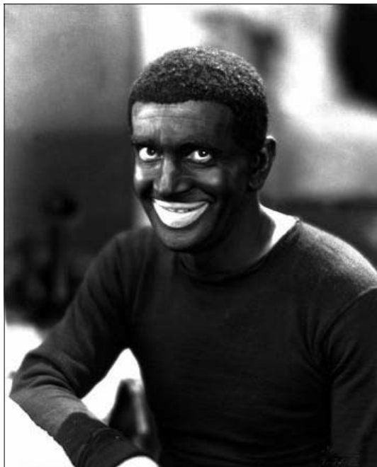
Fig. 12. Al Jolson, the blackface jazz singer.

“I got some burnt cork and put on a rehearsal for the benefit of the old man. In his opinion I