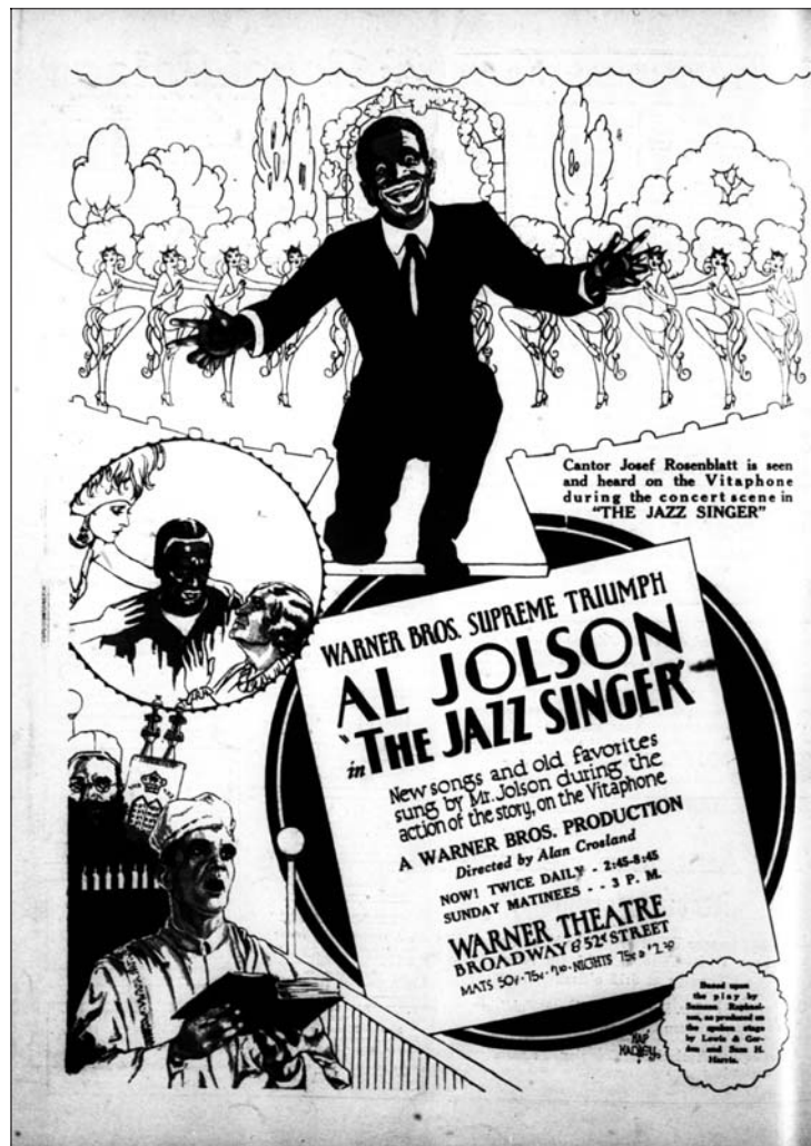
Fig. 3. This full-page advertisement for The Jazz Singer appeared in American Hebrew , 21 October 1927.

shared Jewish identity and concern). 18 Other scholars have also noted their similarities, but the dynamic generative nature of this relationship has never been considered. 19 In the US of the 1920s, The Ancient Law was obscure – hidden like the English film version of Lady Windermere's Fan . Although Lubitsch did not make The Jazz Singer , his idea was obviously not a secret and is strongly reflected in the completed film. We will obviously never see the audacious masterpiece that Lubitsch would have likely made of it, but textual comparisons suggest that The Ancient Law provided the creative team at Warner Bros. with a reference point in making The Jazz Singer . Here again, the equal drawing on both stage and screen for its antecedents has multiple potential meanings, some of which differ from Lady Windermere's Fan .