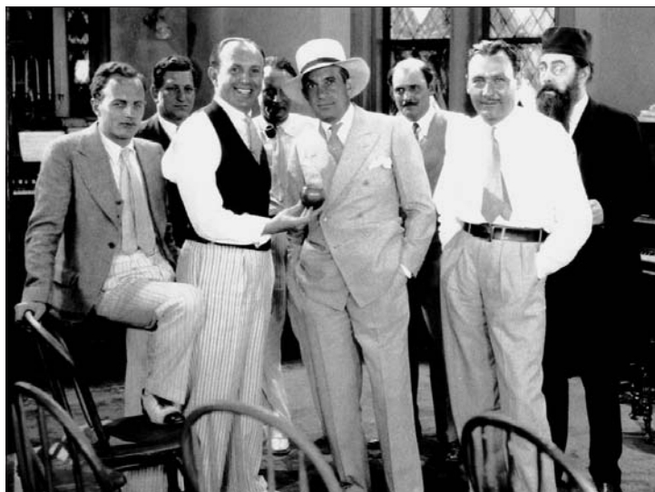
Fig. 4. Darryl F. Zanuck, Jack Warner, Al Jolson, and Alan Crosland pose with other cast and crew members on the set of The Jazz Singer .

Lubitsch was one of the directors with whom E. A. Dupont had apprenticed in Germany. 25 After the success of his instant classic Variety (1925) Dupont went to Hollywood, where the duo enjoyed a reunion. As secular Jews and Berlin-based directors, they shared a sensibility and reference points. For instance, the performance of Romeo and Juliet by the fourth-rate theater troupe in The Ancient Law recalls – if Dupont was not consciously evoking – Lubitsch's Romeo and Juliet in the Snow (1920). By March 1926, in an ironic twist, Dupont himself was scheduled to make a film version of Romeo and Juliet . 26 Dupont (or his agent) had probably been screening his film around Hollywood, and it seems certain that Ernst Lubitsch saw The Ancient Law – either before or (more likely) after he saw the stage version of The Jazz Singer . Perhaps Lubitsch even surmised the ways in which Raphaelson had forged his play from