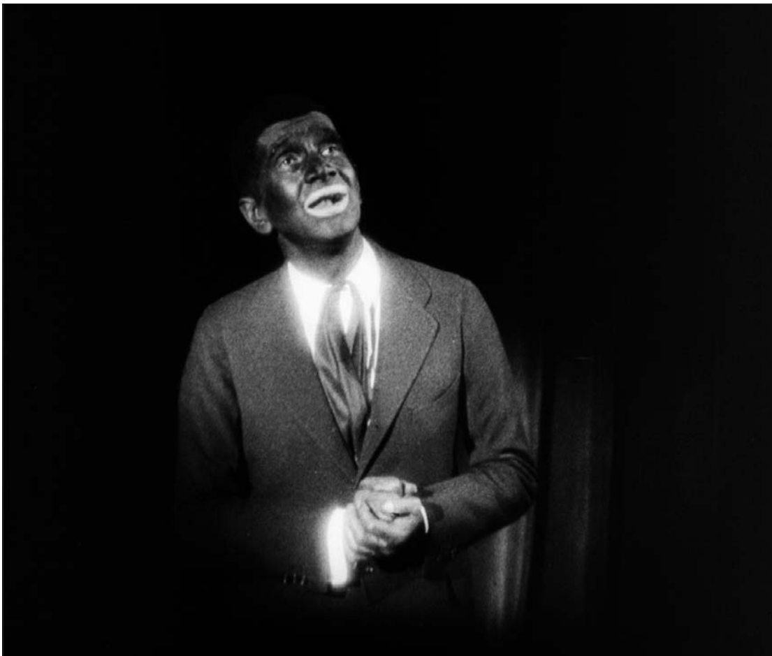
Fig. 19. Al Jolson sings “Mother of Mine”.

You went away, Sweet Mammy! Mammy! One summer night. I can't help thinkin', Mammy, that you went white. Of course I can't blame you, Mammy! Mammy! Dear Because you had so many troubles, Mammy, to bear. 112