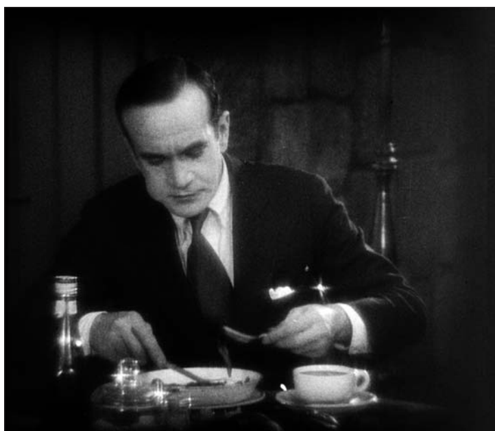
Fig. 5. Breaking with the past: Jack Robin eats ham and eggs in The Jazz Singer , an action which parallels Baruch's cutting his sidelocks in Das Alte Gesetz .