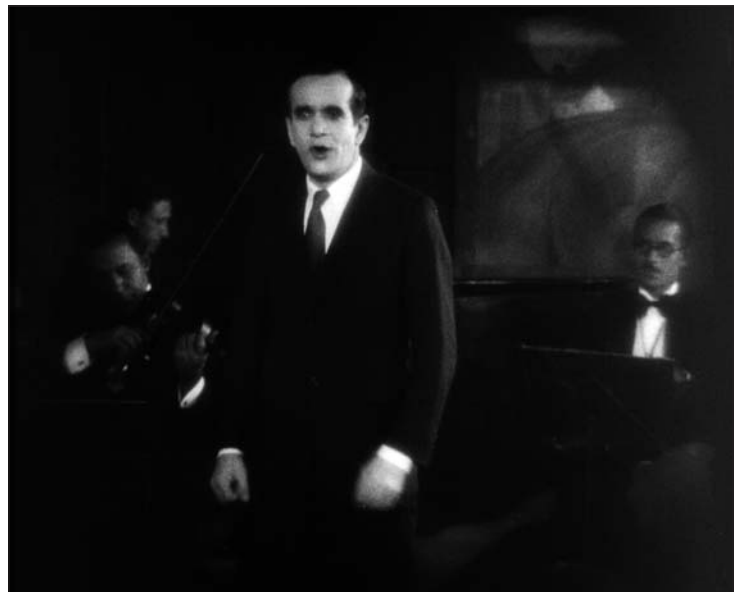
Figs. 8 and 9. In The Jazz Singer , Mary Dale is likewise enchanted by Jack Robin in performance.

theatrical entertainment-religious ritual that generated the melodramatic tension. The 1927 film's simultaneous appropriation of theatrical and cinematic antecedents rejects the stage-screen binary that had opposed dialogue-driven theatrical performance to silent, visual cinema in theory and practice. 29 In this respect, "the talkies" and this new sound film offered a means to transcend elements of the stage-silent screen distinction, and so this burden; such transcendence is also embodied in this mode of adaptation.