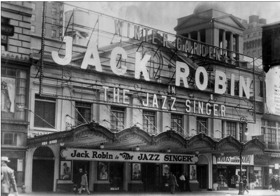
Fig. 2. The Winter Garden, site of Jolson's theatrical triumphs (and two blocks from the Warners' Theatre), dressed as the site of Jack Robin's breakthrough hit – The Jazz Singer .